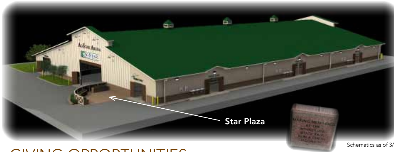
Schematics as of 3/11

The Arena Campaign is administered by the Minnesota State Fair Foundation, a 501(c)(3) nonprofit preserving and improving State Fair buildings, grounds and educational experiences.